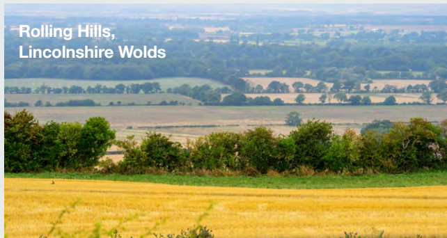
Rolling Hills, Lincolnshire Wolds