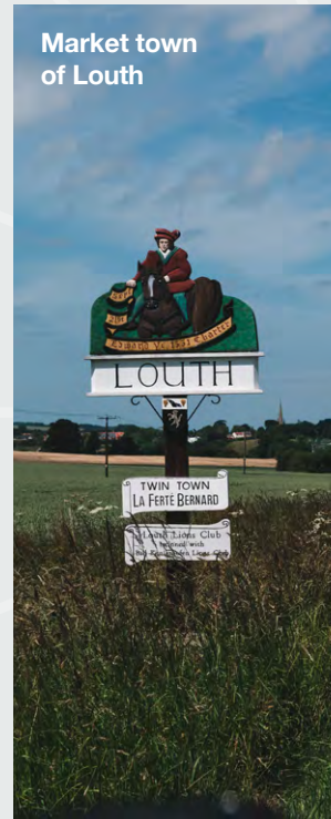
Market town of Louth

Louth is known to be a foodie's haven with its specialist grocers, and local butchers. It is also home to The Cheese Shop, which has gained nationwide recognition, including in The Daily Telegraph, The Guardian, and appeared on The Hairy Bikers' Food Tour of Britain.